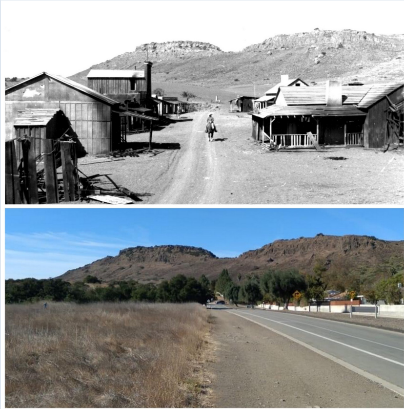
Janss Western Town was built along what is now the entrance to Wildwood.