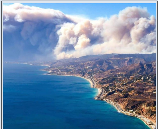
More frequent and intense fires, such as the Woolsey Fire seen above, can lead to permanent degradation of native landscapes.