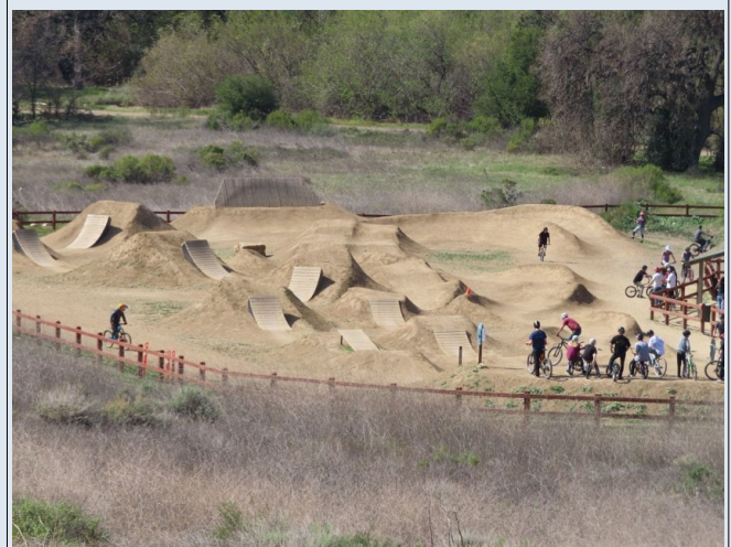
Every contest entrant identified the Sapwi Bike Park correctly.

We post each contest on our Facebook, Twitter and Instagram accounts, as well as emailing interested contestants. If you would like to be added to the “Where” email list, drop a note to news@cosf.org to let us know.