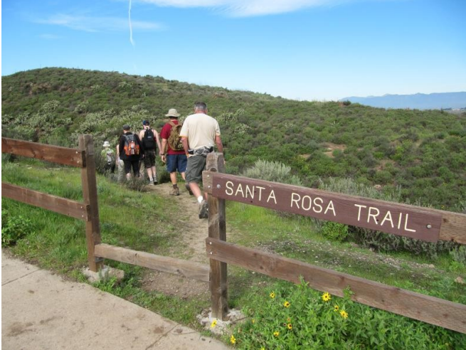
Santa Rosa Trail Spur trailhead