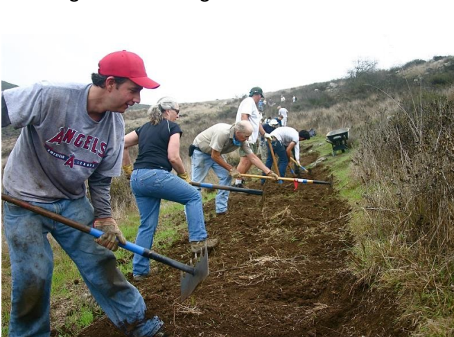
Building the Shooting Star Trail