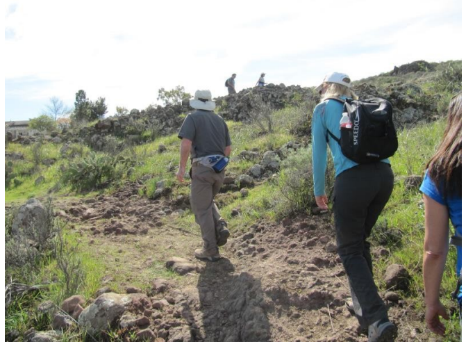
Santa Rosa Trail Spur